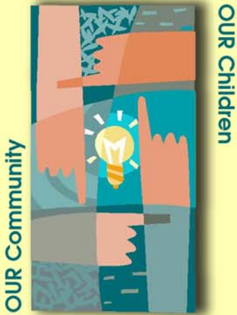
Newsletter for the Lancaster County Community Groups